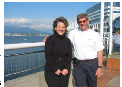
"Our heartfelt appreciation"

Applications available at Olds Jr. Sr. High School